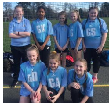
Year 7 Wrexham schools Team Champions!