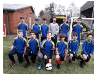
The Year 10 team who finished second in the recent football tournament held at Cefn Druids.