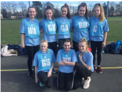
Year 8 Wrexham schools Team