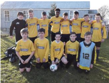
The Year 8 football team who recently beat Ruabon 2-1 and St Joseph's 6-1.